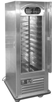
Full Length Door Model RAC37-FHS